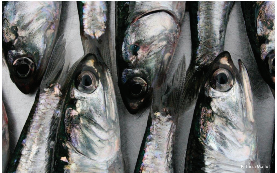
Anchovies at a Lima market. Peruvian anchovy is the largest single-species fishery in the world, and most of the catch is processed into industrial fishmeal.

Peruvian anchovy is the largest single-species fishery in the world, and it supplies one-third of the world's fishmeal. But a new economic study published in the journal Marine Policy shows that human consumption of seafood in Peru—including anchovies and all other fish species—generates more than twice the domestic revenue and three times the jobs as the production of fishmeal and fish oil.